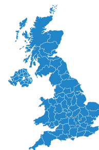
Great Britain Coverage